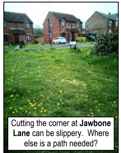
Cutting the corner at Jawbone Lane can be slippery. Where else is a path needed?

Get in touch with one of the Focus Team.